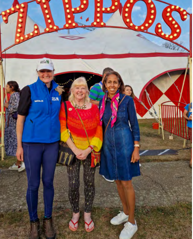
Mayor and consort with Zippos team workers