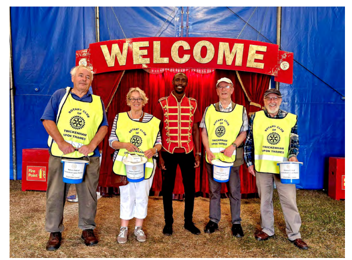
Rotary Club of Twickenham upon Thames